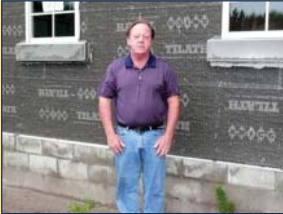
DL Walker Concrete 8323 Ramona Blvd W • Jacksonville, FL 32221 904-265-7173